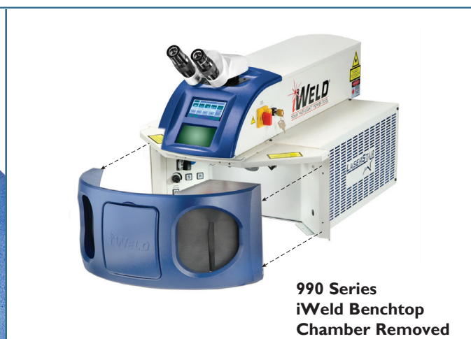
990 Series iWeld Benchtop